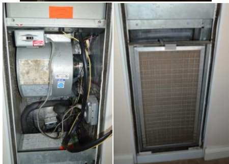
(b) Fan motor/ squirrel cage

Please see below preventative cleaning detail. This lower vent is the portion of the AC unit that will be serviced by AOA and can only be accessed by AOA. It is wholly the responsibility of the AOA to maintain and clean the interior of this section of the AC unit and is on a PM Cleaning Schedule.