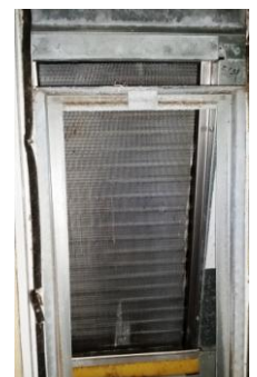
(d) Fan coil